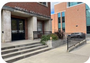
Front entrance (faces Graham Ave)