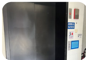
MIB elevator, located just inside rear entrance