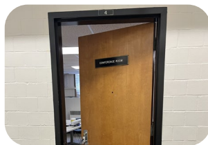
Door to conference room (MIB 004)